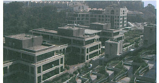
Main campus of the HK Institute of Education

JOS was engaged by the Hong Kong Institute of Education (HKIEd), the only University Grants Committee funded institution dedicated to the upgrading and professional development of teacher education in Hong Kong, to upgrade its existing PABX systems. JOS will help HKIEd make the transition to IPT by replacing its Nortel TDM PABX with a Nortel Networks IPT system, as well as equipping it with unified messaging facilities.