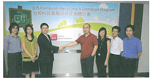
Representatives from JOS and HKCSS held the program briefing for social service organizations about the program details.

Companies in HK interested to donate computers and computer accessories please call the Programme's hotline (852) 2590 9090 and press 2 > 1 > 6. ●