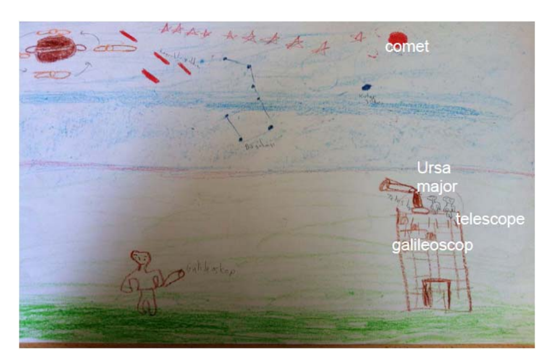
Fig 3 3-C student's picture