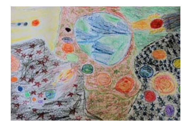
Fig 1 1-A student's picture

This picture shows that the student perceives the universe as a colorful, crowded place but at the same time it moves in a certain order. The smile on the face of sun (near the right bottom) indicates that it is known as friendly, familiar and different from other stars. The explosions and burning in the stars are represented by two images. Depicting the Earth so big in the center means the child is looking at space