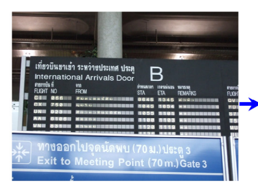
1. Came out from "Arrival Hall B" of Bangkok Int'l Aiport