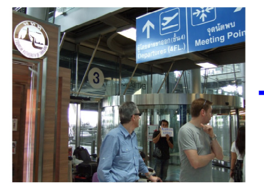
4. This is 'Entrance 3'