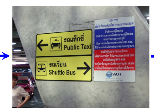
7. Then you turn left (you will see a sign like this on the wall)

Keep walking till for 1-2 mins and you will find taxi counters