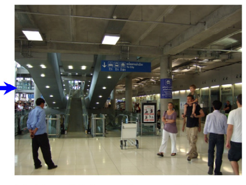
5. Turn Right and you will find an elevator for bringing you to the G/FL of Bangkok Int'l Airport.