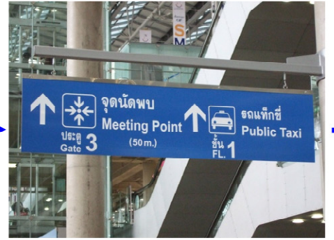
2. Turn Left and you will find a sign showing you to Gate 3